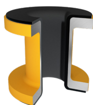
Spacers Type H in Antistatic version