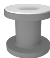
Standard finishing: gray epoxy-vinyl zinc paint