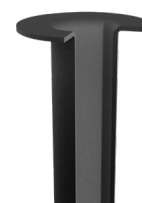
Antistatic version of Conveyor